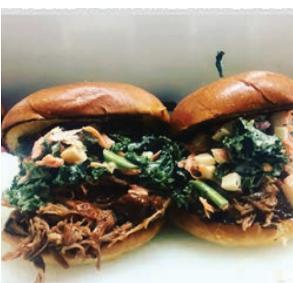
Located in the Village, Pronto's offers a great variety of catering options.

outdoor putting green, outdoor saline swimming pool, patio with fire pit, as well as Home2's Spin2Cycle, fitness/laundry facility, where guests can wash clothes while working out. For more information visit Home2suitesCarlsbad.com