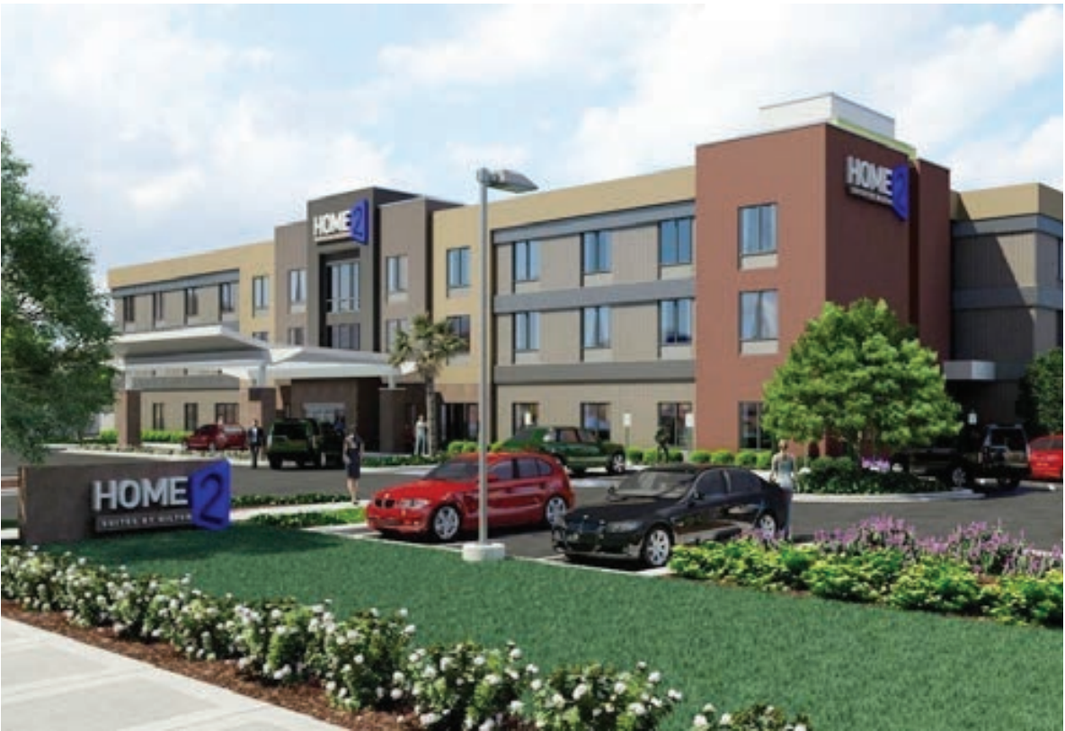
Home2Suites offers guests several amenities so they can feel right at home in Carlsbad.