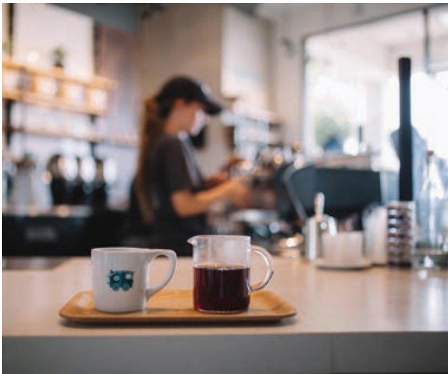
New to Bressi Ranch, Bird Coffee Roasters has won multiple national and international awards for their coffee.