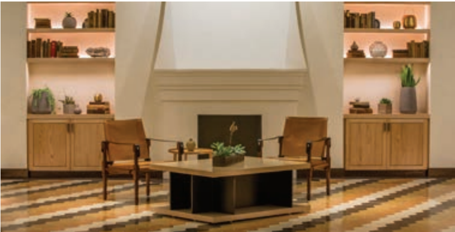
Four Seasons Aviara's Corporate Partner Travel Program is ideal for corporate relocations in the North San Diego area.