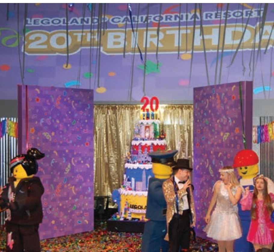
New attractions, events, entertainment and special surprise exclusive to the resort highlight LEGOLAND® CALIFORNIA's birthday fun all year long!

Here's a chance to experience movie making magic as you step onto our LEGO soundstage and explore the awesome LEGO Models as seen in The LEGO Movie 2: The Second Part. You'll see Emmet, Lucy, and their LEGO co-stars as well as their hometown of Apocalypsburg. You'll be amazed by the details that go into making this exciting new big-screen LEGO adventure! Open this April, minifigures and maximum adventure will come to life in the world of LEGO® City with "LEGO® City 4D- Officer in Pursuit", a new 4D film debuting at LEGOLAND California's LEGO Showplace Theater. The new short will combine dazzling 3D computer animation with 4D real-world effects in the