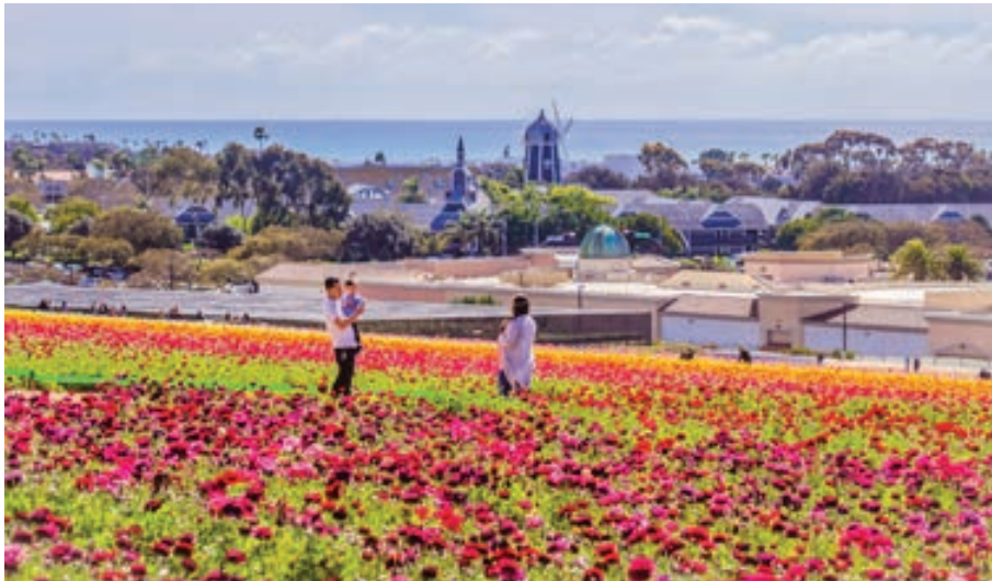
Carlsbad by the Sea Hotel's iconic windmill lies between The Flower Fields and the beach, two of Carlsbad's ever-growing list of attractions.

There are seasonal fairs and festivals in Carlsbad Village, along with new venues and restaurants consistently popping up. Think of a hidden speak-easy – or unique dining options like the Windmill Food Hall opening this year (also on site at Carlsbad by the Sea Hotel).