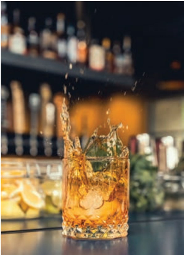
Eureka's beverage program revolves around the restaurant's commitment to serving All-American premium products.

Eureka! specializes in American classics with a modern twist. Menu highlights include the Mac N’ Cheese Balls made with a beer cheese sauce and Fresno chiles; Bone Marrow Burger featuring shiitake bone marrow butter, char-broiled onion, mustard aioli, and roasted Roma tomato; and Fresno Fig Burger with fig marmalade, melted goat cheese, bacon,