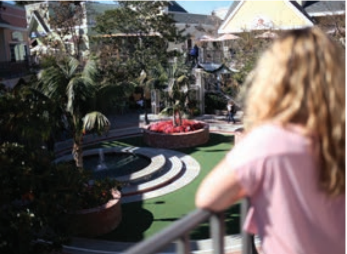
With its New England-style architecture mixed in with a Caribbean flare, Village Faire has everything for the entire family.