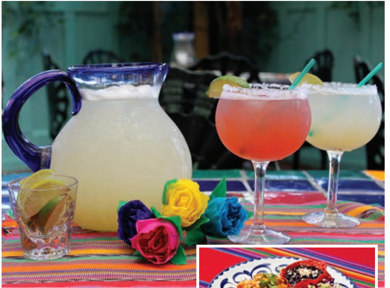
Cool down with margaritas at Casa de Bandini.

Casa de Bandini also specializes in custom-designed events such as banquets, rehearsal dinners, graduation and birthday parties, and any other special occasion. A large outdoor patio with a lush and vibrant garden has capacity for 125 guests for dining under the stars. A smaller cocktail patio more intimately seats up to 30 guests under the