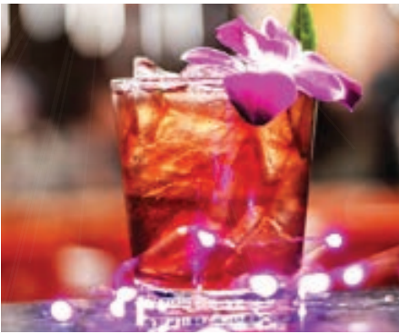
The pomegranate based PomBomb is a favorite at Señor Grubby's.

hosting fundraisers for sports teams, schools, non-profits, families in need, and more. We are here to help!