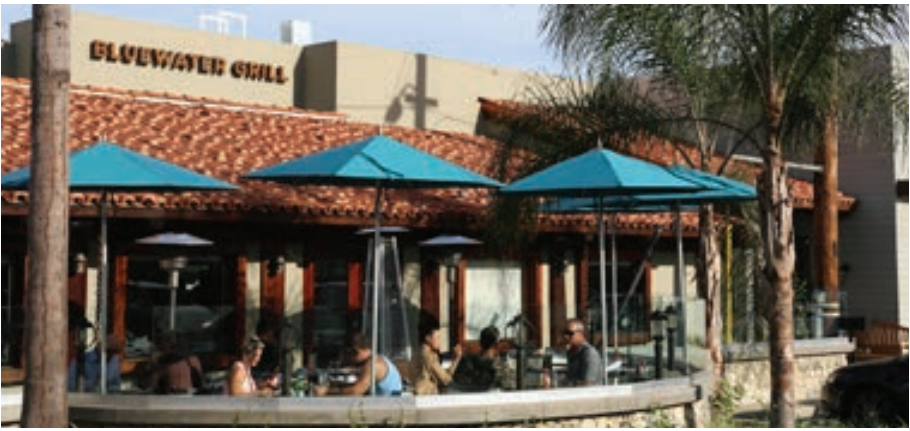
Since its debut Bluewater Grill has been providing an atmosphere of casual coastal style.