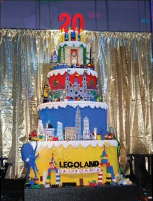
This massive LEGO® cake, standing seven- feet tall and created out of more than 51 thousand LEGO® bricks is one of the party decorations used by LEGOLAND® California Resort to kick off its yearlong party.

Park's latest quest to save the city. The movie is exclusive to LEGOLAND Parks and features tons of action and laugh out loud moments that will appeal to everyone. There's even more to celebrate in 2019 with an all new LEGO® Friends Live Show and Character