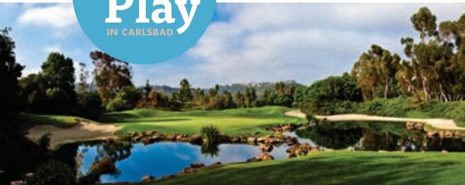
Tee off at the internationally renowned Aviara Golf Club, the only Arnold Palmer signature designed course in San Diego.