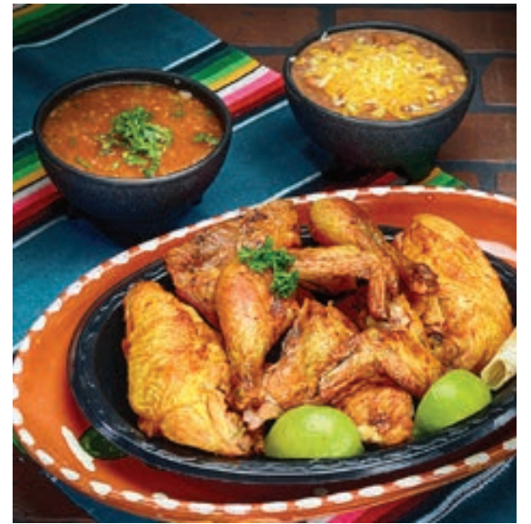
Treat your party to authentic Mexican cuisine at Pollos Maria.

For reservations or more things to do in the Carlsbad area, visit CarlsbadHotelByTheSea.com and check out the entire dining and adventure guide!