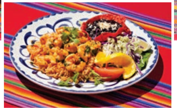
Tequila Lime Shrimp

Call 760-634-3443 or visit www.casadebandini.com .