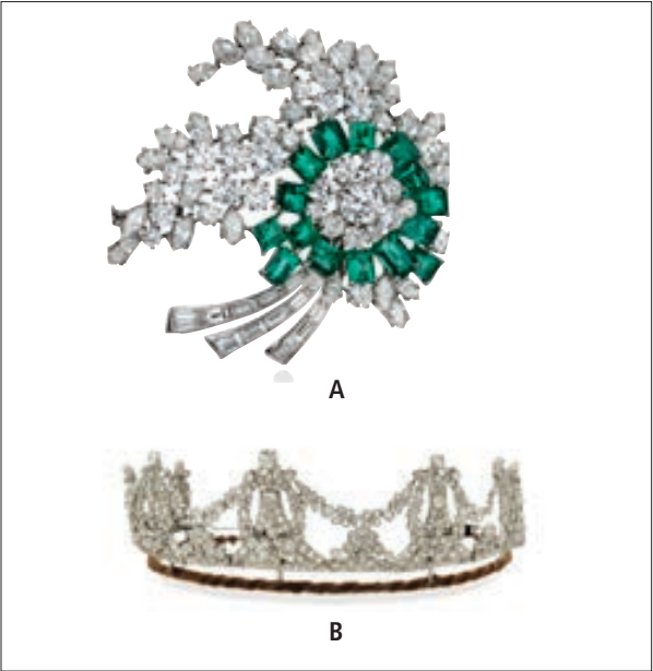
A) Faye Dunaway's diamond and emerald brooch set in platinum contains approximately 15 carats of diamonds and five carats of emeralds.

The magic of jewelry doesn't stop there. GIA's museum has more than 1,000 pieces on display throughout the campus above the Carlsbad Flower Fields . You can even visit the world's