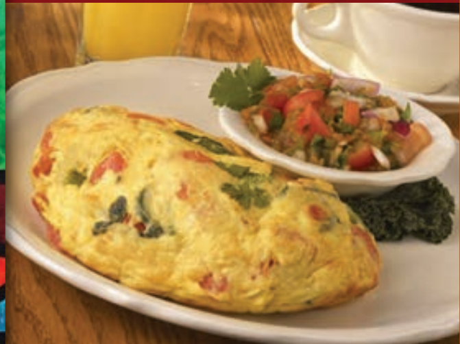
Santa Fe Omelette