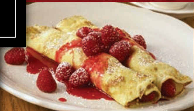
Summer Raspberry Crepes