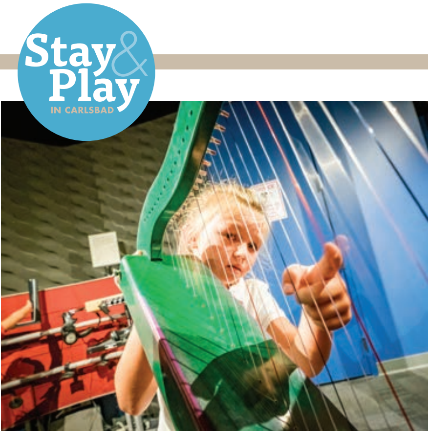
Take a hands-on journey through the history of making music.