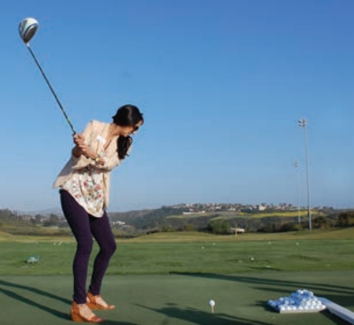
For people looking for fun things to do this summer, The Crossings has several popular weekly events.

For more information visit us online at www.thecrossingsatcarlsbad.com or call 760-444-1800!